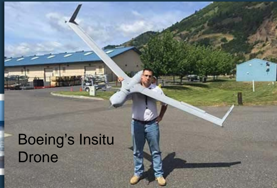
Boeing's Insitu Drone